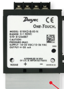
Optional NPT connection block